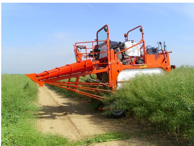
Separating cones lifted to easily maneuver at the end of the field