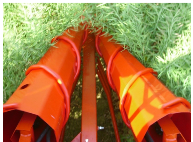
View on cones from driver's seat