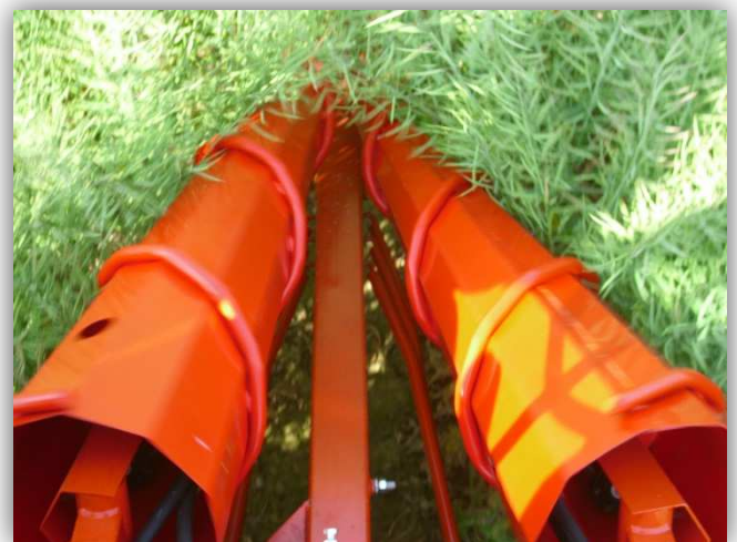
View on cones from driver's seat