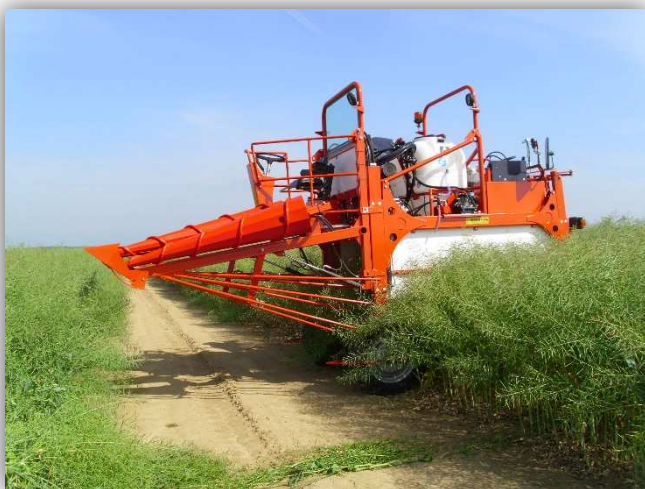
Separating cones lifted to easily maneuver at the end of the field