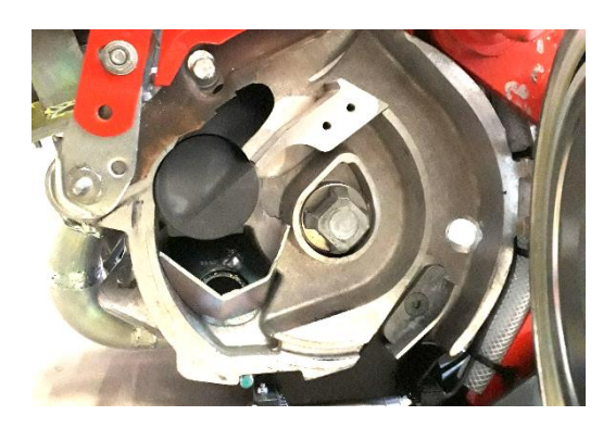
More reactive, Raised and rotative hatch